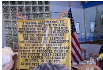
Fellowship District IV Club Award Banner