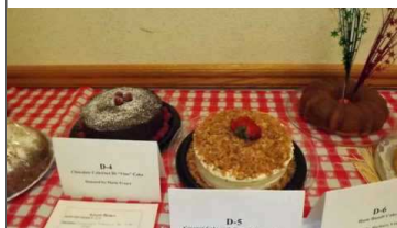
Ten luscious desserts were on the table for silent bids, and could be taken home or shared with others