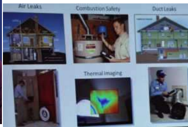
Speaker from PG&E's "Energy Upgrade California" program explained how to have your house tested & receive incentives and rebates while increasing your home efficiency. 1-12-2012

What will be Tested? Air Leaks, Combustion Safety, Duct Leaks Heat Loss via Thermal Imaging